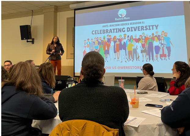
Our team members were very engaged and now feel more comfortable talking about race in the classrooms.

Last month we had the pleasure of hosting Restore More at our school for an equity audit. This audit supports administrators in determining the progress of our equity goals and provides steps for improvement. We also concluded Restore More's anti-racism series with a session on "Celebrating Diversity."